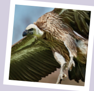
African White-backed Vulture